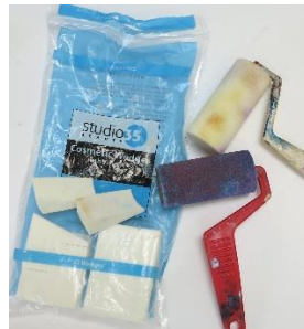
Sponges and rollers