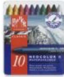
Caran d'Ache Wax Watersolible