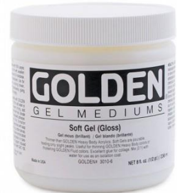
soft gel jar-used for glue