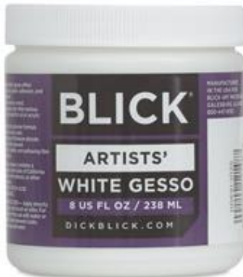
bottle or jar of gesso