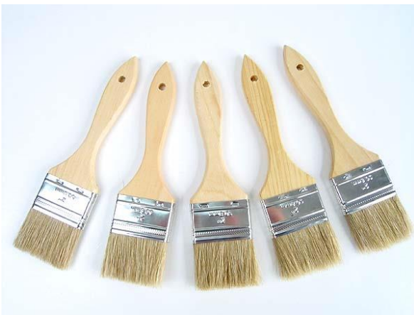
Chip Brushes...just need one found at the hardware stores.