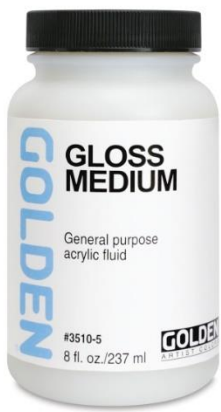
Gloss Medium a Must/ 16 oz or larger.