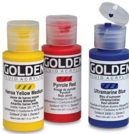
Acrylic paints, Any brand of fluids great for stained tissue paper