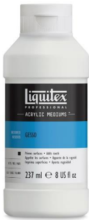
Gesso in bottle works best.