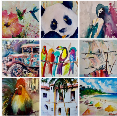
JOIN NOW! Watercolor & Acrylic Classes ADULT