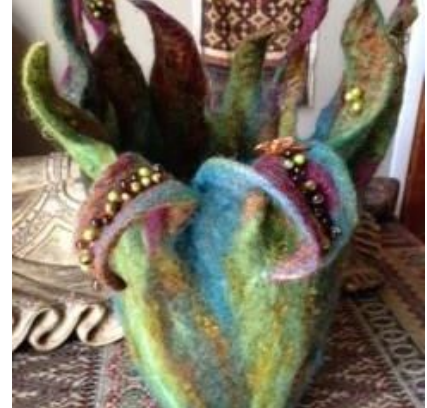
FEBRUARY 22 Felted Vessel Class ADULT