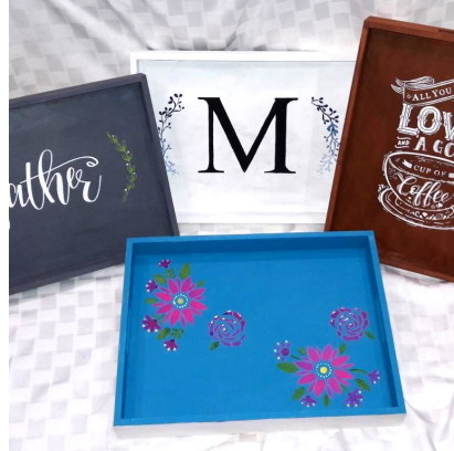
STARTING SOON FEB 19 Painted Serving Tray Class ADULT